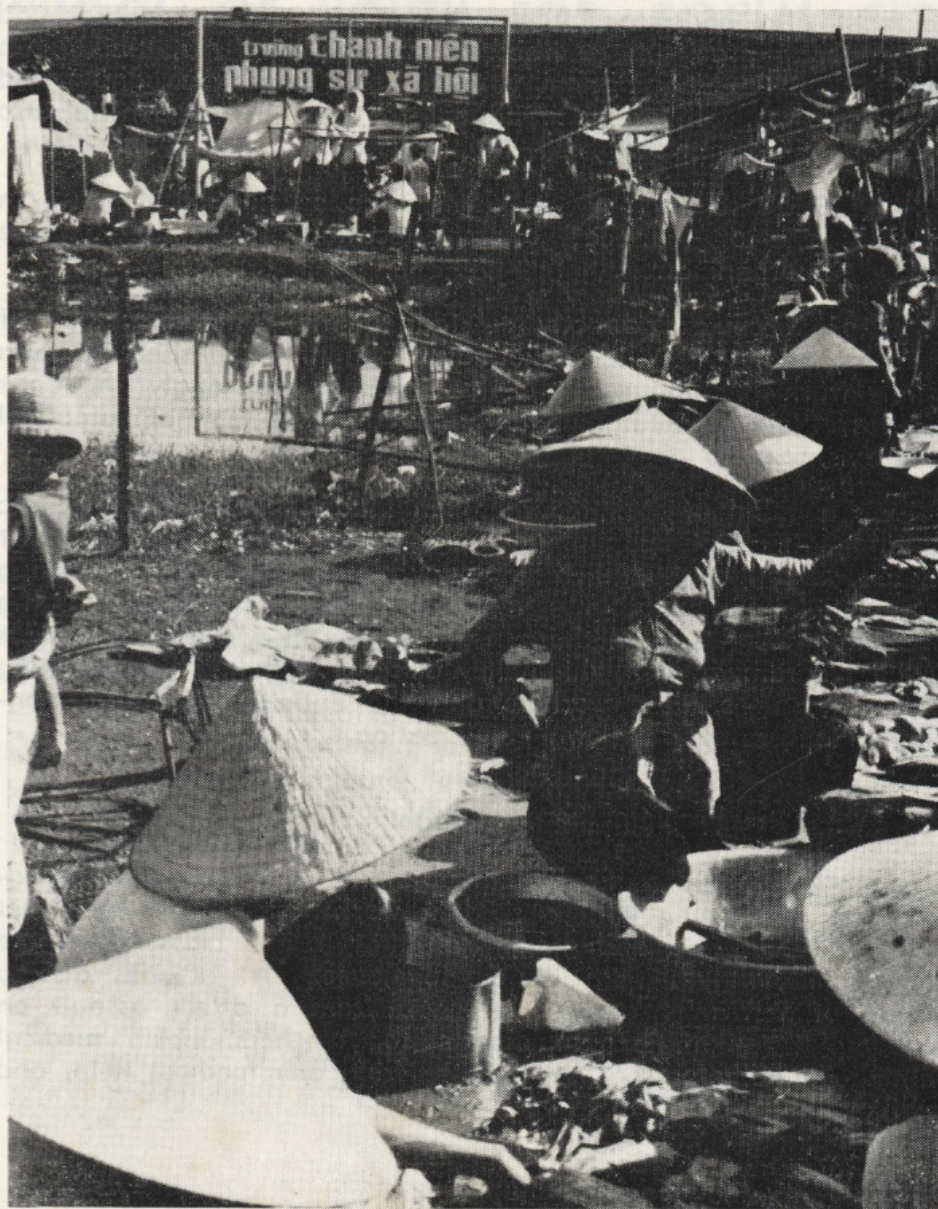
The first day inside a refugee camp run by student workers