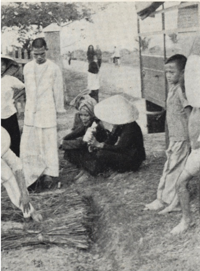
er way to grow mushrooms