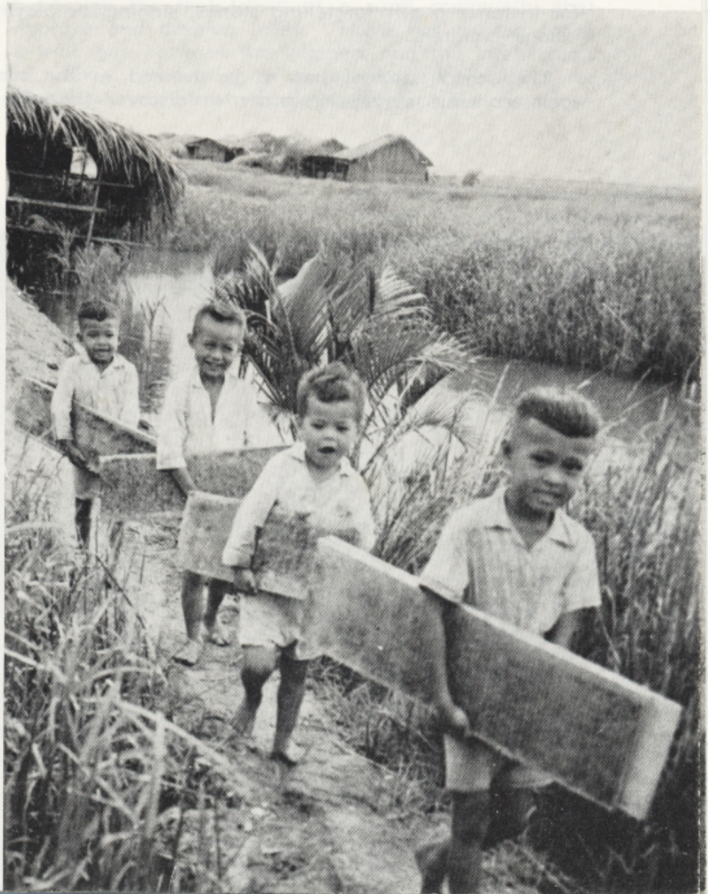
Village children helping student workers

AN EFFORT BY THE BUDDHISTS IN VIETNAM FOR RURAL RECONSTRUCTION AND FOR THE RELIEF OF WAR-INDUCED SUFFERINGS