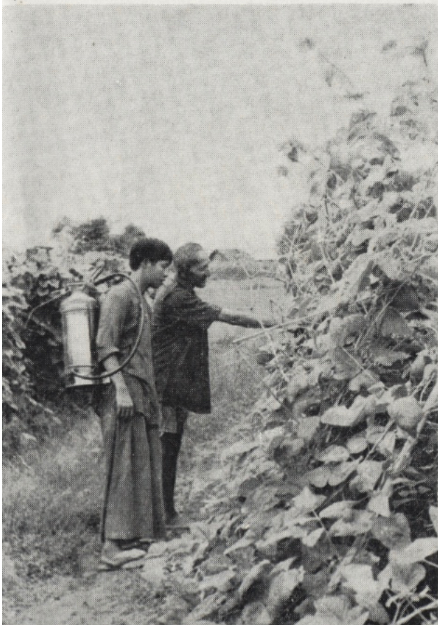
Sharing experience about crop protection with an old farmer