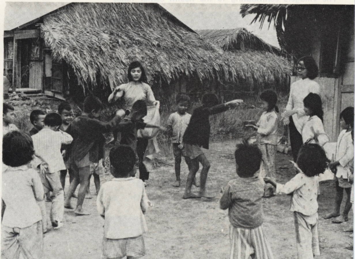
Teaching village children games

At the beginning, the relief of war victims was not the primary task of the student workers. However, with the intensification of the war and its propagation into urban areas, the student workers have been forced to invest the greatest part of their energy and time in the task of maintaining life. Refugees crowd into centers set up by workers from the School, which range in size from an approximate total of 780 refugees (Tu Nghiem Center) to that of 26,000 (Ha Thanh Center). The Campus of the School itself once served as a temporary refugee camp for 11,987 persons during six months beginning May 1968 to October 1968. Hundreds are still living there waiting for facilities to resettle.