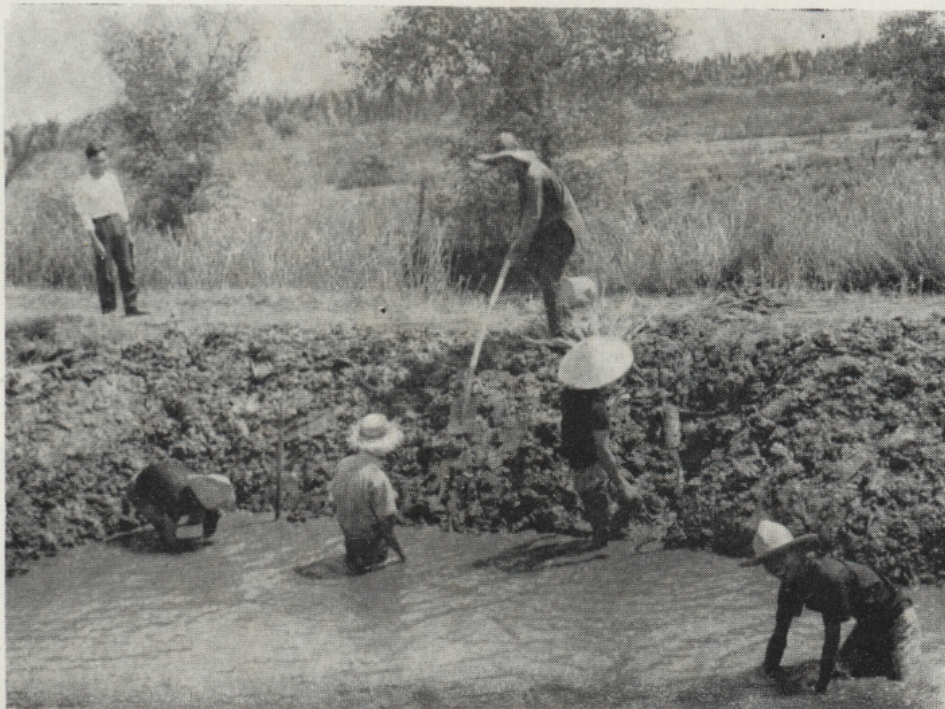
"How to grow fish"