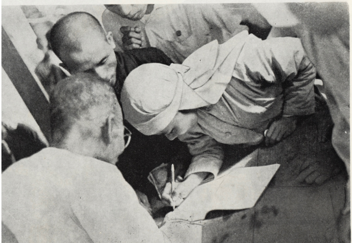
The villagers contributing to the health center funds

Some of the still pressing needs of the School are: a few more dormitories, scholarship aid, busses for transportation, teaching equipment, books, facilities for duplicating teaching materials, funds for travel to and from the villages as well as for living expenses on the projects and for reasearch. Funds are also needed for the maintenance of students who graduate from the School