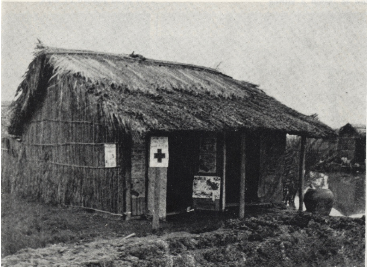
The first "health center" of a village

In all of these, a team begins its work under the direction of a supervisor who stays with the team until it is well established and then resumes his traveling to another village and continues a constant circuit of this sort. The team itself finds out very quickly from experience how to recruit corps of assistants among the young people in the villages themselves, and some of the most promising and committed of these are sent back to the school from time to time for a few days of intensive training.